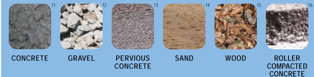
11 CONCRETE 12 GRAVEL 13 PERVIOUS CONCRETE 14 SAND 15 WOOD 16 ROLLER COMPACTED CONCRETE